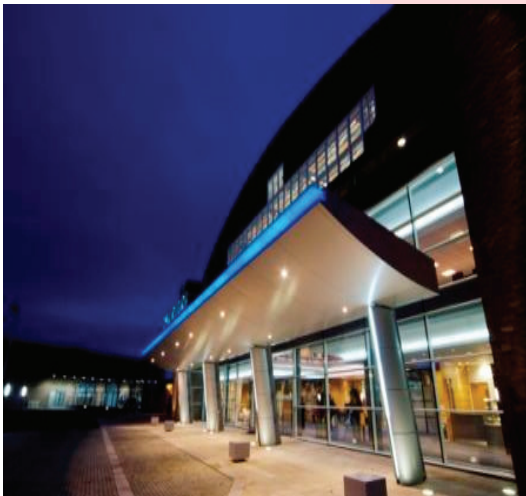
Speke Aerodrome – Littlewoods headquarters

To support the expected growth of on-line retailing Littlewoods Shop Direct Group has a highly valuable and efficient infrastructure that no other UK retailers can rival – sourcing, warehousing, single pack distribution and home delivery to customers.