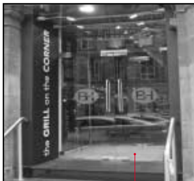
The Grill on the Corner Glasgow

Living Ventures are now concentrating on a rebranding exercise of the remaining 15 strong estate with two new brands Blackhouse Grills and Gusto Restaurant and Bar.